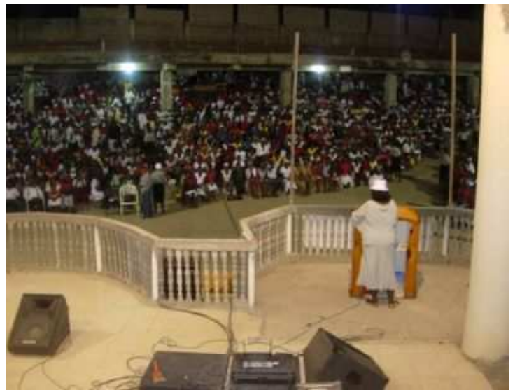
One of the night sessions.