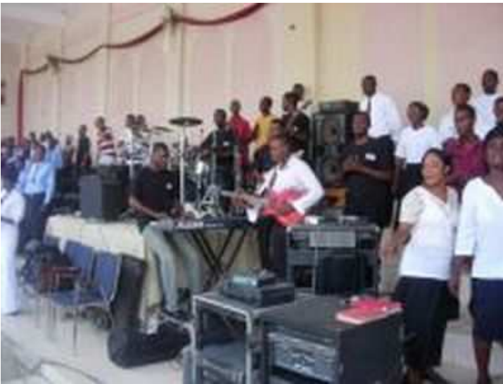
The praise band that led worship.