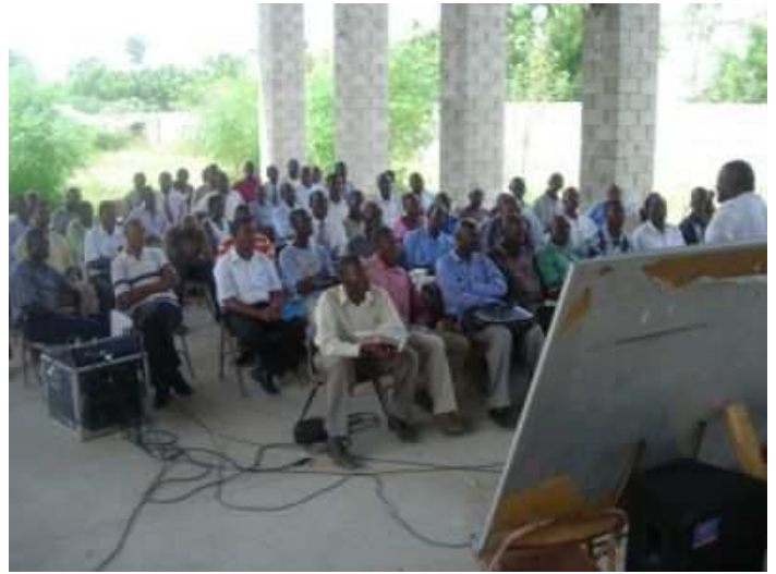
The “one-day” pastor’s meeting in Berci.