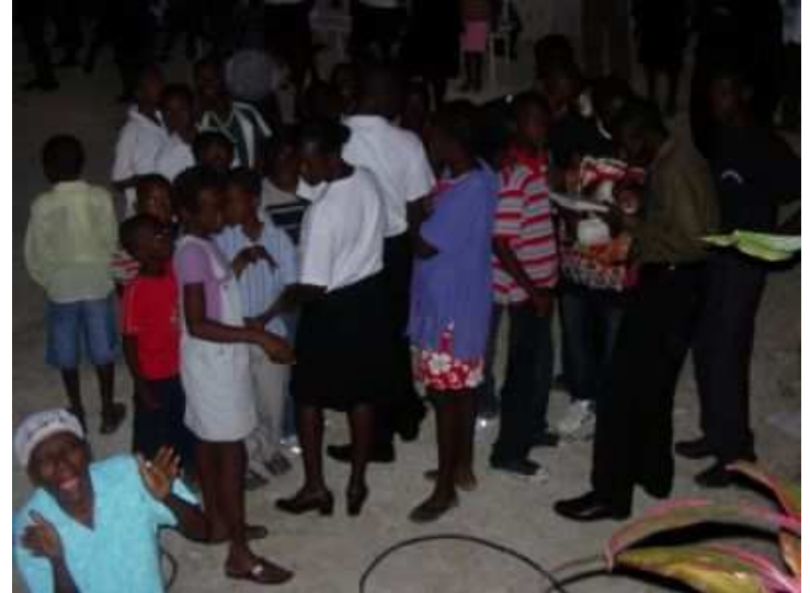
One of the invitations.