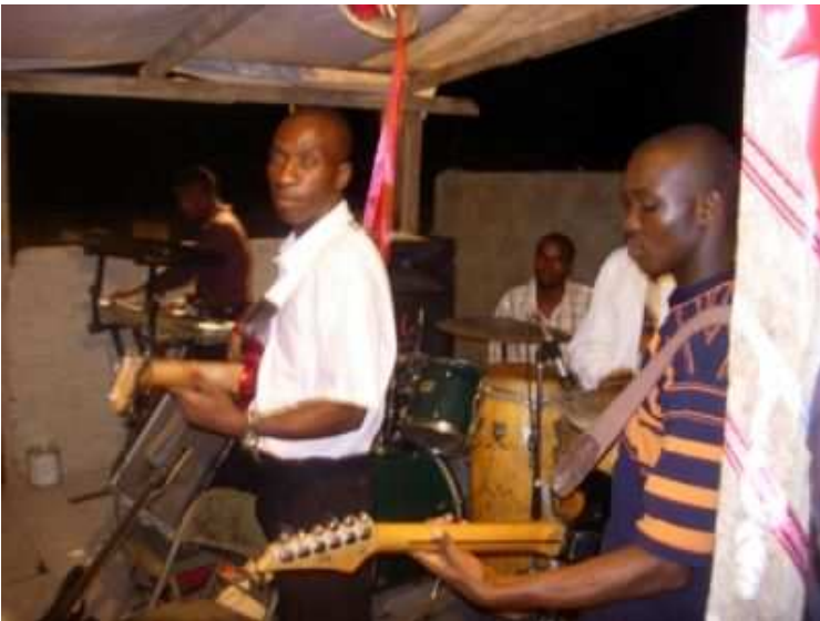
The praise band. They love their music.