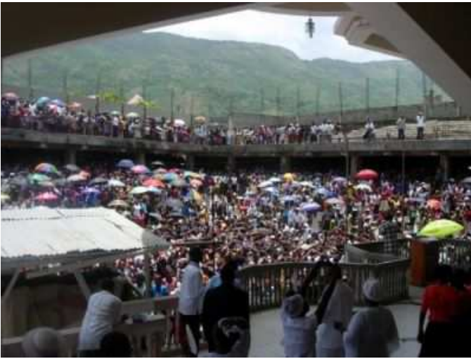
This is a portion of the crowd at the Tabernacle church in Cap Haitian where I preached the first week.