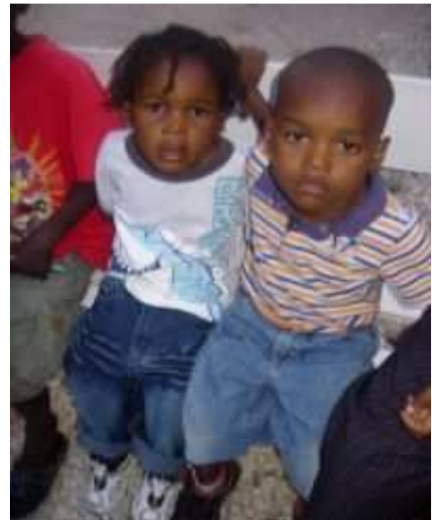
Beautiful little children at the crusade.