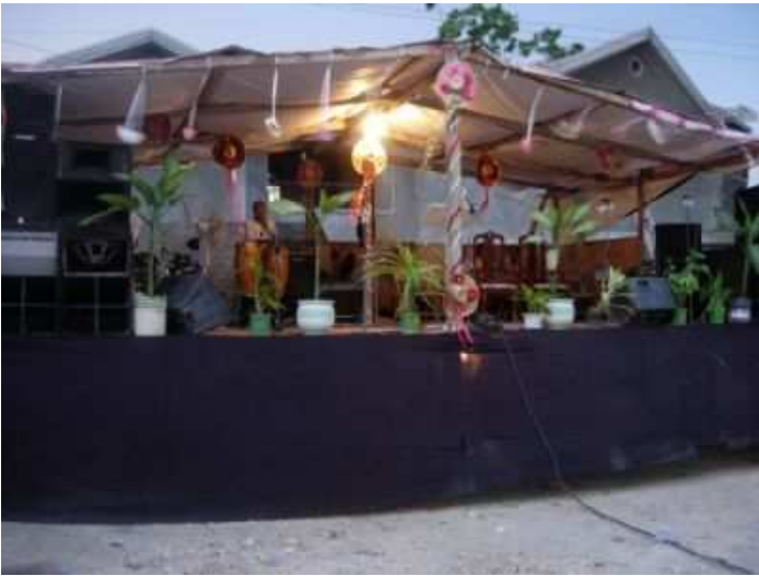
The crusade platform in Port-au-Prince.