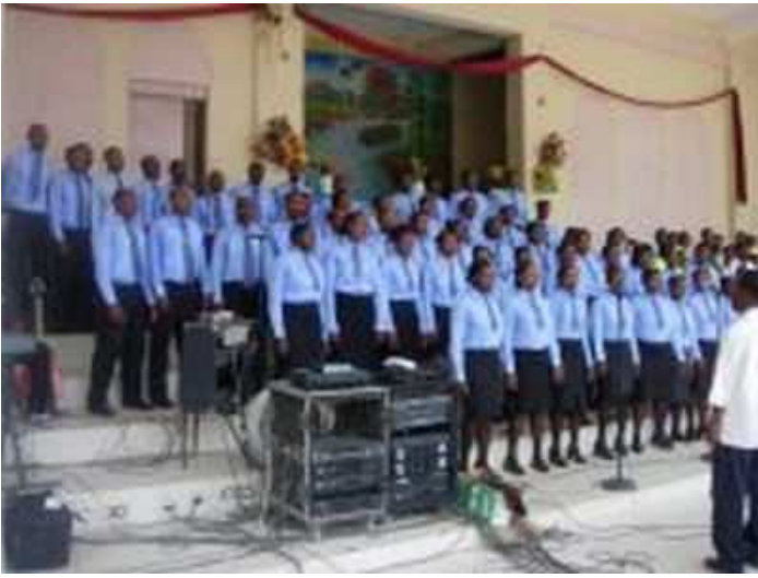
The Tabernacle choir was the best I had ever heard in Haiti.