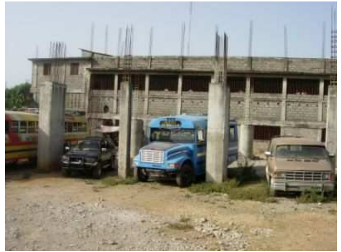
This is an outside view of the unfinished building at the Tabernacle.