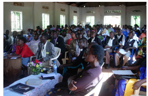
Pastors & church leaders in the 2nd conference in the Kiboga district.