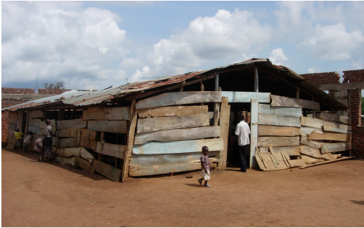
The church in the Namatumba district where our conference was held for the 1st week.