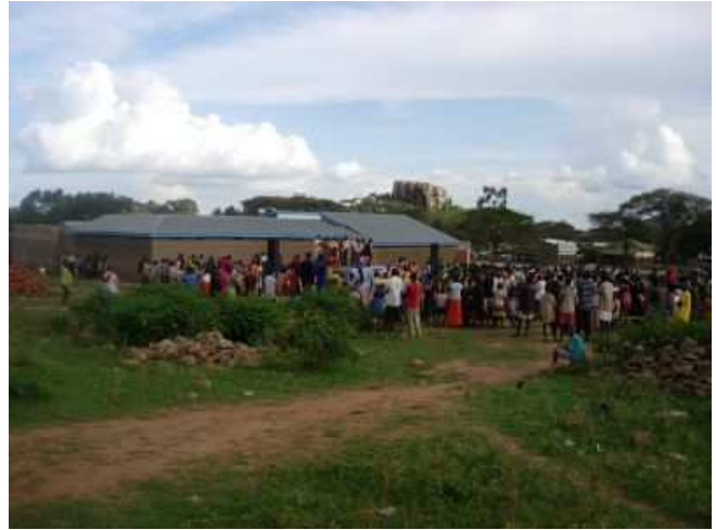
The crusade crowd with the choir leading Music on the platform.