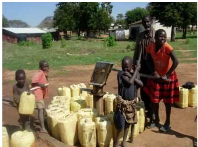
This is the well where our water came from for the house.