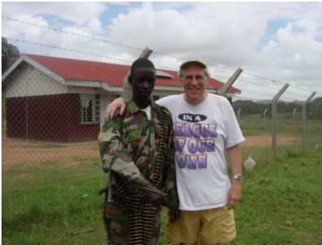
Here I am with one of our two armed guards in front of the little house that we had half of.