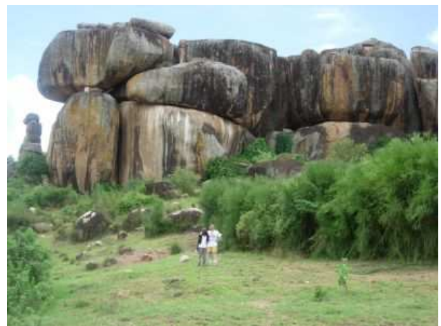
This is one of the many amazing rock formations very close to where we stayed in Kaabong in N.E. Uganda.