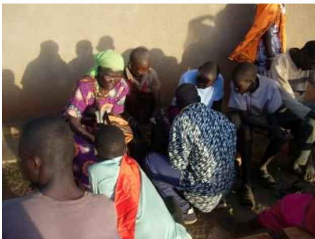
Counseling with those who made decisions for Christ.