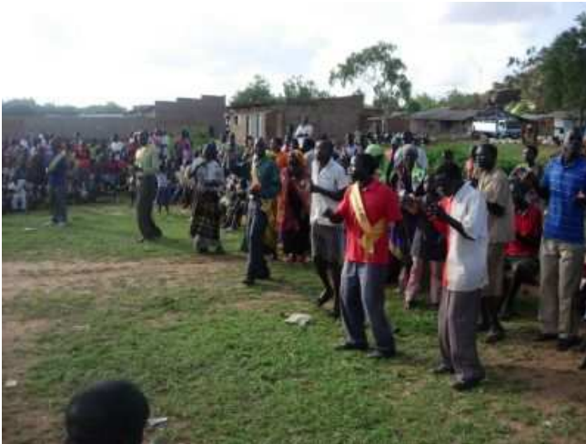
The crusade crowd enjoying the music.