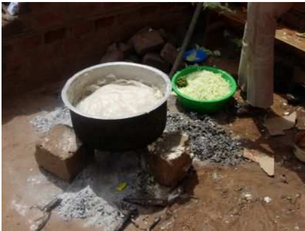
Food preparation for the 180 who registered at the conference