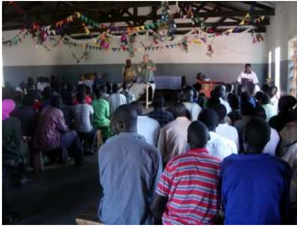
LM teaching at the training conference