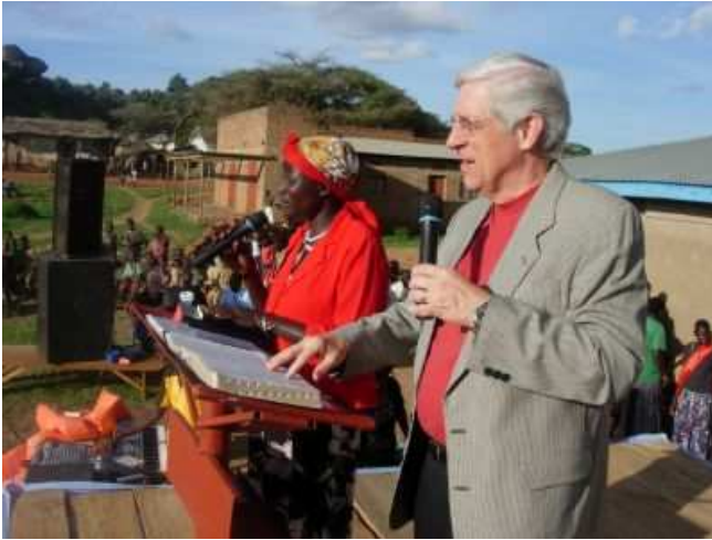
LM preaching at the crusade with my female Interpreter.