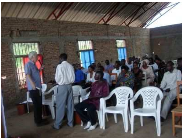
Here I am teaching at the Pastor's training Conference in Rwanda.