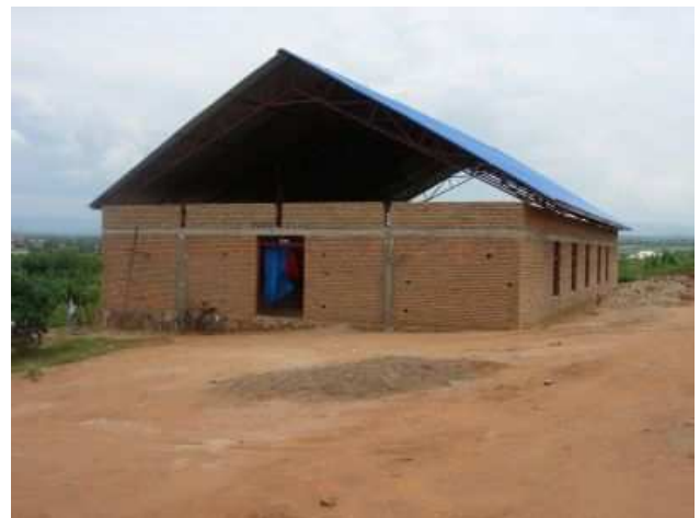
This is the church where we did the Pastor's school in Rwanda. Our women's conference was in another church.