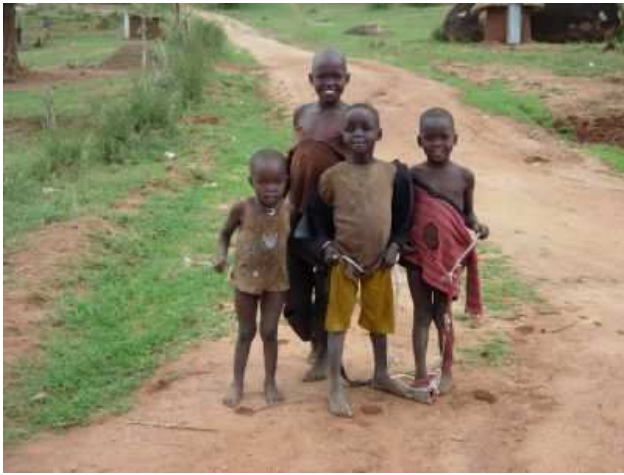
A typical group of children just a few yards from where we stayed.